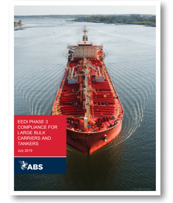
EEDI Phase 3 Compliance for Large Bulk Carriers and Tankers