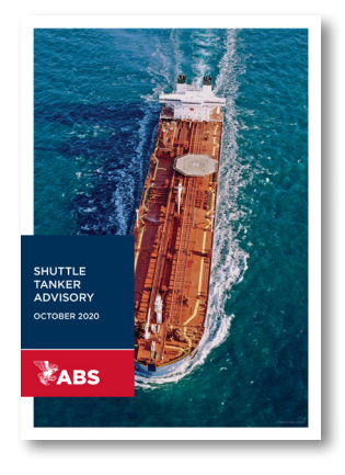
Shuttle Tanker Advisory