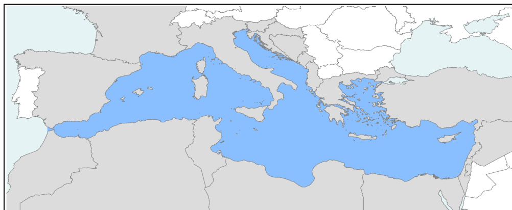
Figure 1. Contracting Parties to the Barcelona Convention (in grey) and proposed area of the Mediterranean SOx ECA (in blue)

These amendments will enter into force on 1 May 2024, but ships operating in this ECA will be exempt from compliance with the 0.10% m/m sulphur content standard for fuel oil during the first 12 months immediately following entry into force of the amendment (in accordance with MARPOL Annex VI / Regulation 14.7).